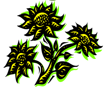
From the Sunflower State.

You will be able to register online for those events as the time approaches. These three events provide the opportunity to get State (KS, OK & MO) updates (no CPE) as well as Federal sessions for CPE.